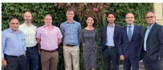
East Anglian Vitreoretinal group